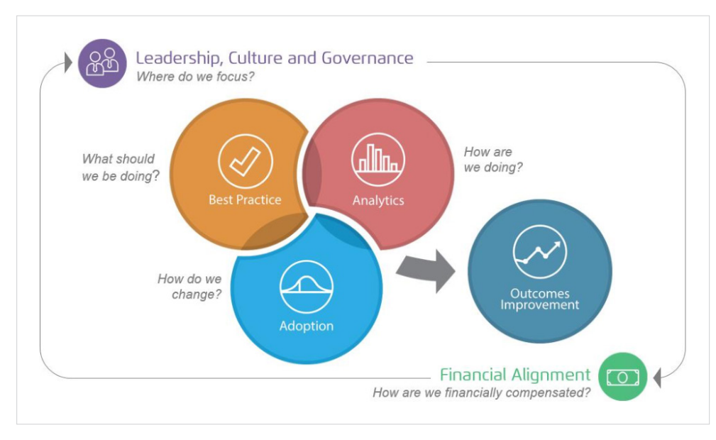
Figure 1. Key areas for success in outcomes improvement.