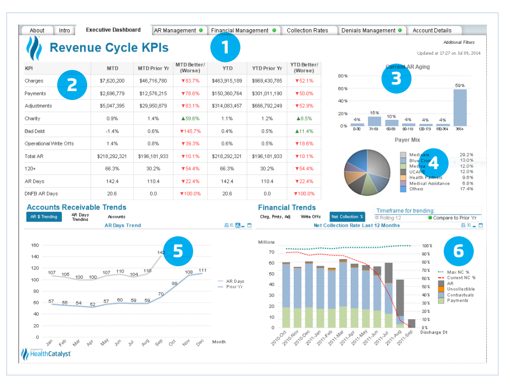
Figure 1 Sample Revenue Cycle Explorer executive dashboard.

The application enables the team to identify operational problems that can lead to denials. Figure 2 shows an example of the denials management dashboard that arranges denials into actionable categories. The revenue cycle team can quickly research by variance, denial code, location, payer, provider and CPT code (for professional billing) to identify root causes before they turn into